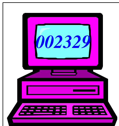
WSU Title IV (Federal) School Code

Wayne State University Office of Military & Veterans Affairs http://sdcl.wayne.edu/omva/omvahome.html Provides an explanation of the educational benefit programs available to veterans and their dependents.