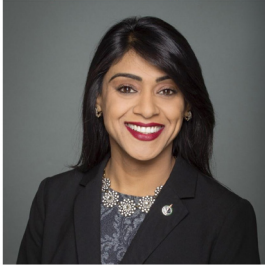
The Honourable Bardish Chagger Minister of Diversity and Inclusion and Youth