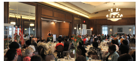
Over 200 guests attended the dinner at the Detroit Golf Club