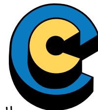
the CHILDREN'S Center

technical assistance to The Children's Center of Detroit . By serving on the agency's Quality Assurance and Program Committee, we consult on client utilization data, quality measures, and how to improve client outcomes. Three strategies are now being implemented as a result of this partnership including literature reviews, focus groups and a clinical training assessment. ■