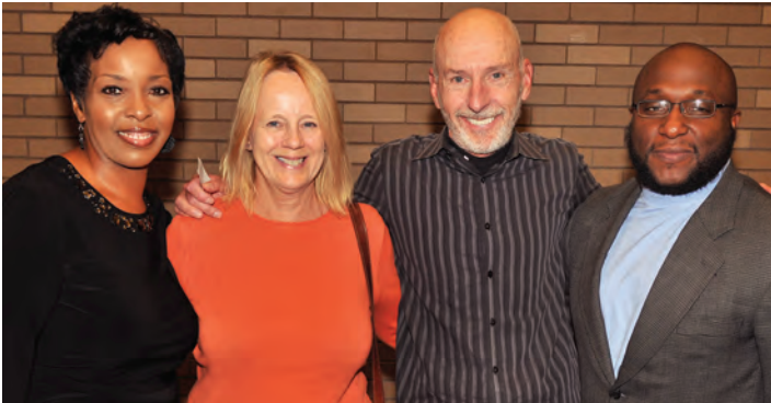
Caption to come