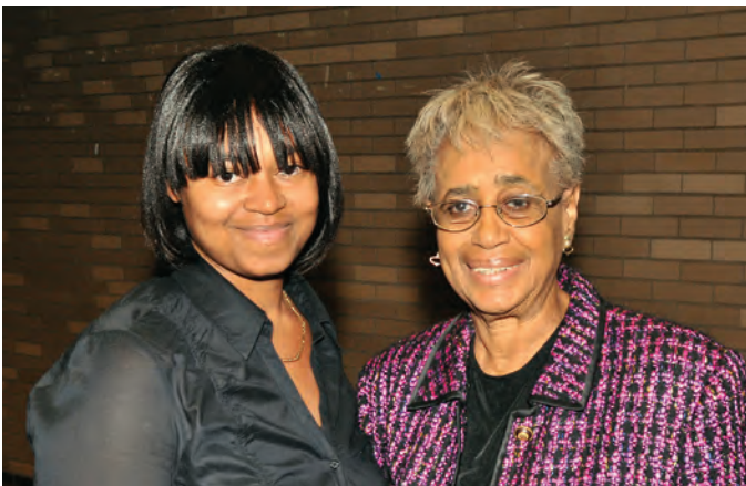
Caption to come

Clip and return this form, completed, with payment to: WSU Alumni Association, P.O. Box 02308, Detroit, MI 48202-0308